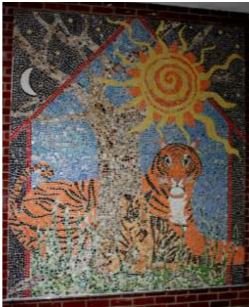
Mural Outside Cottle School Upper Wing

The Tuckahoe School Foundation is dedicated to assuring the continued excellence of our schools by facilitating and developing academic enrichment programs and other innovative educational projects. The Foundation is a non-profit organization comprising community, business and civic leaders working in collaboration with the administration and the Board of Education to secure independent, voluntary funding for these programs and to involve parents, community members, alumni and the private sector in enhancing the education of every child in our district.