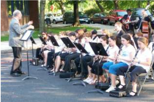
The 5th Grade Jazz Band playing with students from the Julliard Jazz Ensemble. Special thanks to the Generoso Pope Foundation for providing funding for the Julliard Jazz Ensemble.