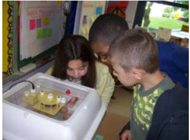
Above: Cottle students checking on the progress of the chicken eggs.