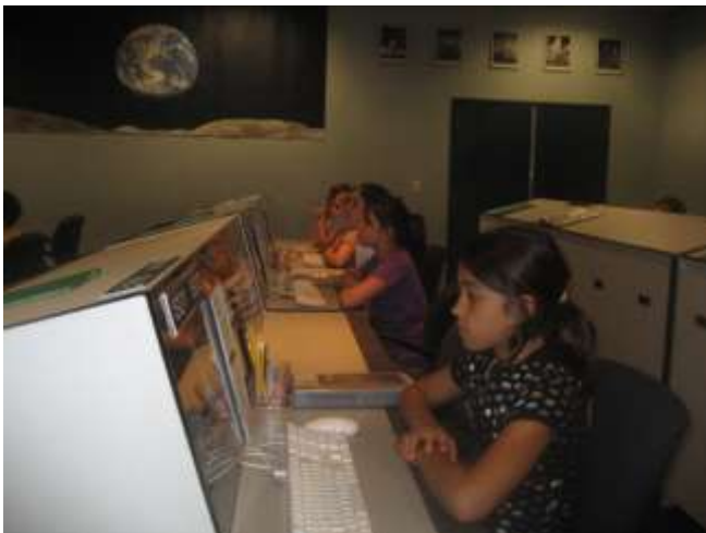
This is Mission Control: Ready to Launch!