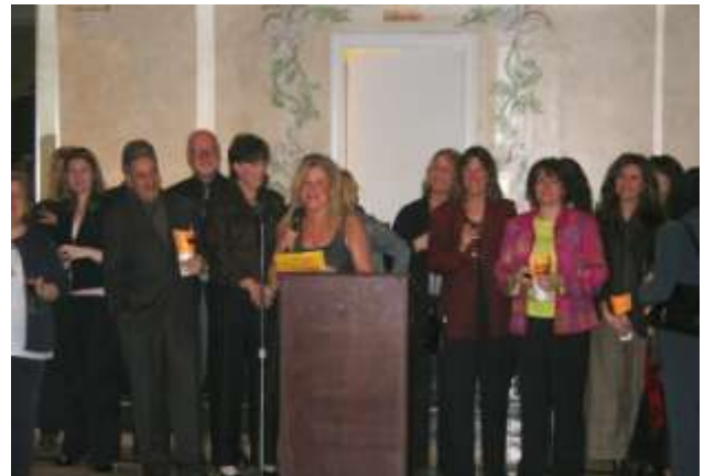
Tuckahoe School District Faculty and Staff