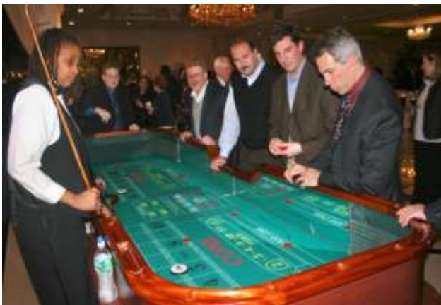
TSF Members and friends enjoying Casino Night